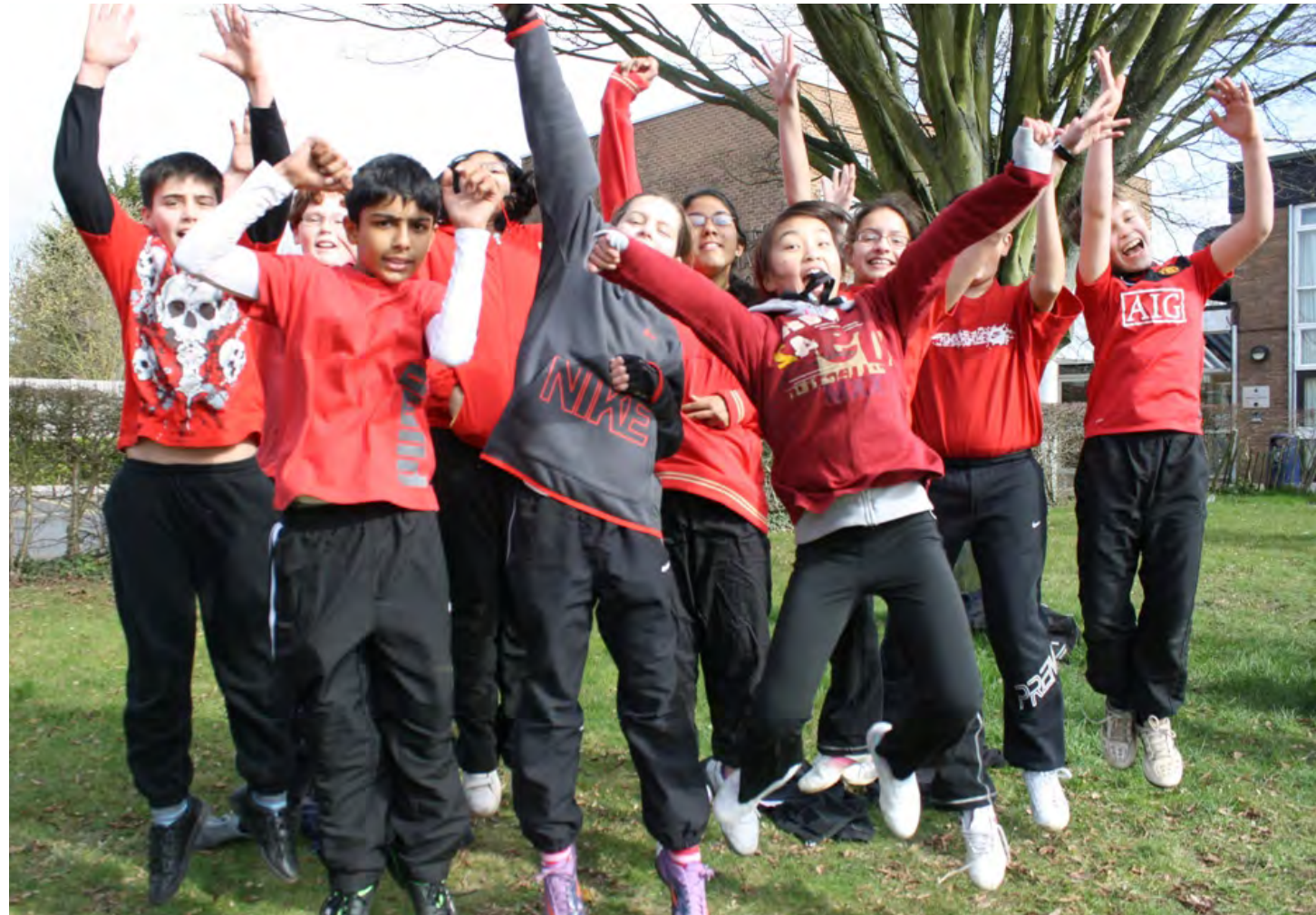
Inter-form sports challenge

Throughout Year 7 our trained Year 10 Student Companions are attached to each form and provide an additional friendly face for students to approach if they have any problems.