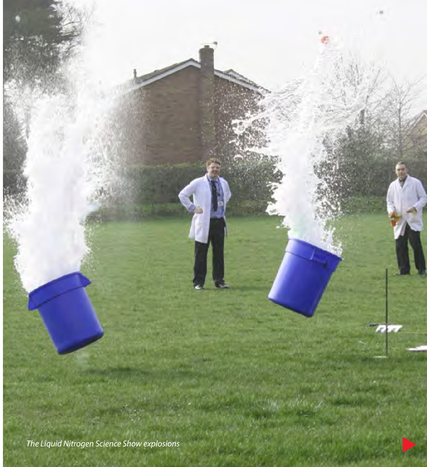
The Liquid Nitrogen Science Show explosions

Our active partnership with our local family of schools and community enables us to share resources and disseminate good practice in science, maths and languages education. This expertise has been recognised at both a county and national level.