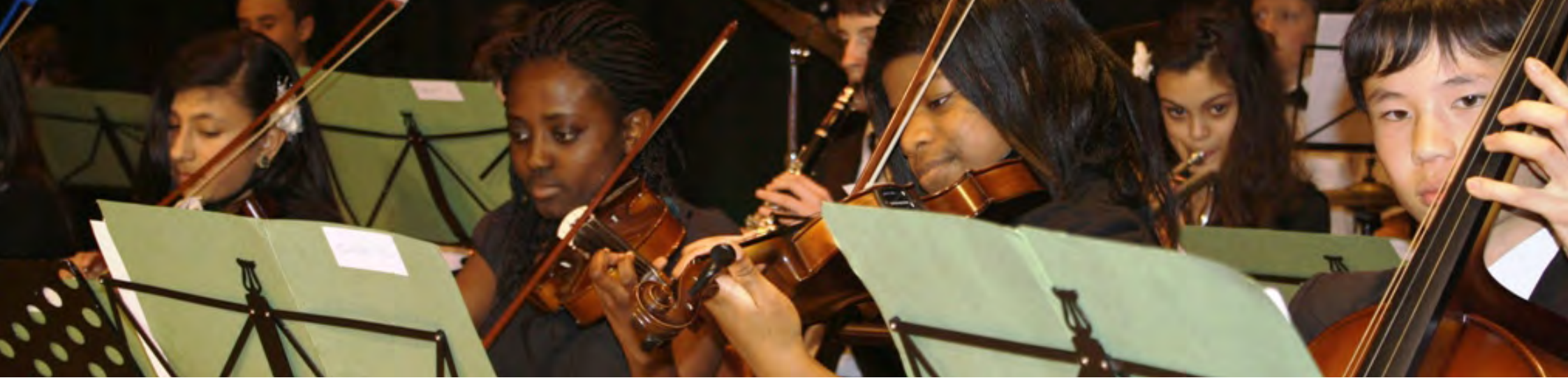
The school orchestra performing