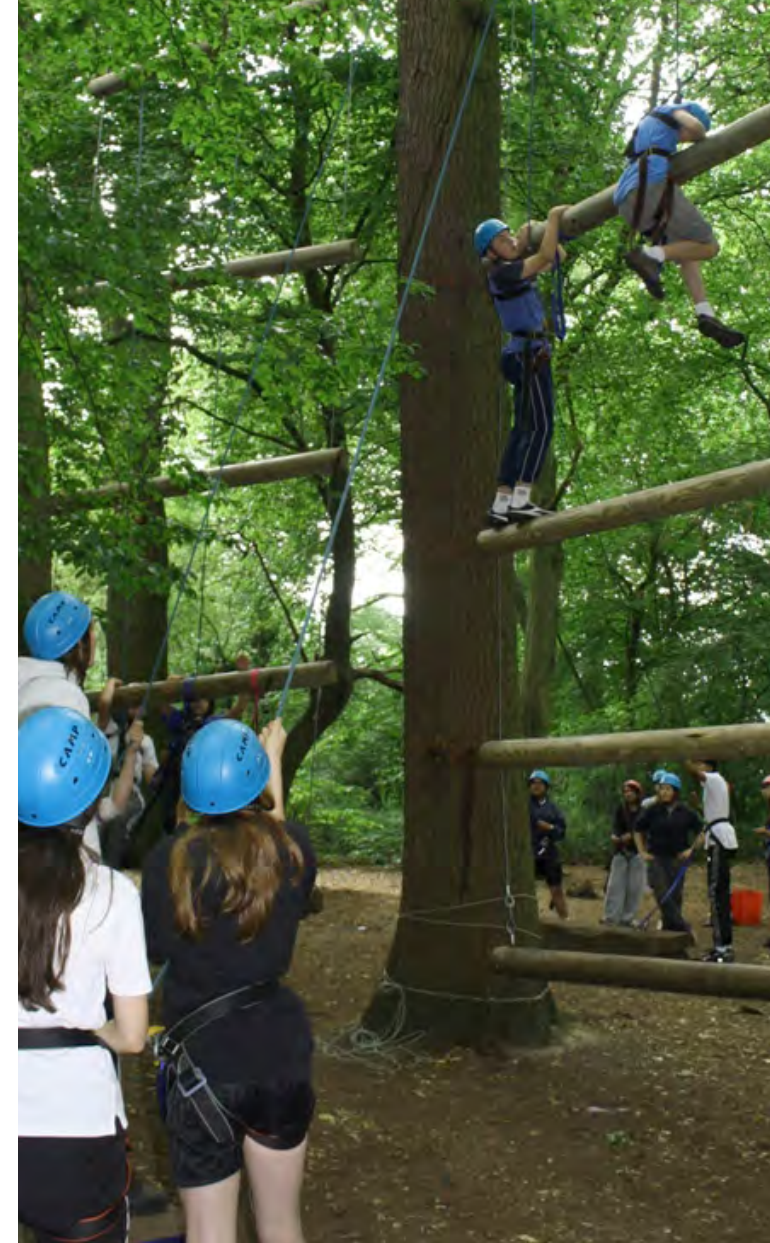
Activity Day challenge

Students' work in a variety of fields has led the school to be awarded the Intermediate International School Award , the Silver Eco Schools Award and the Gold Democracy Award from the UK Youth Parliament.