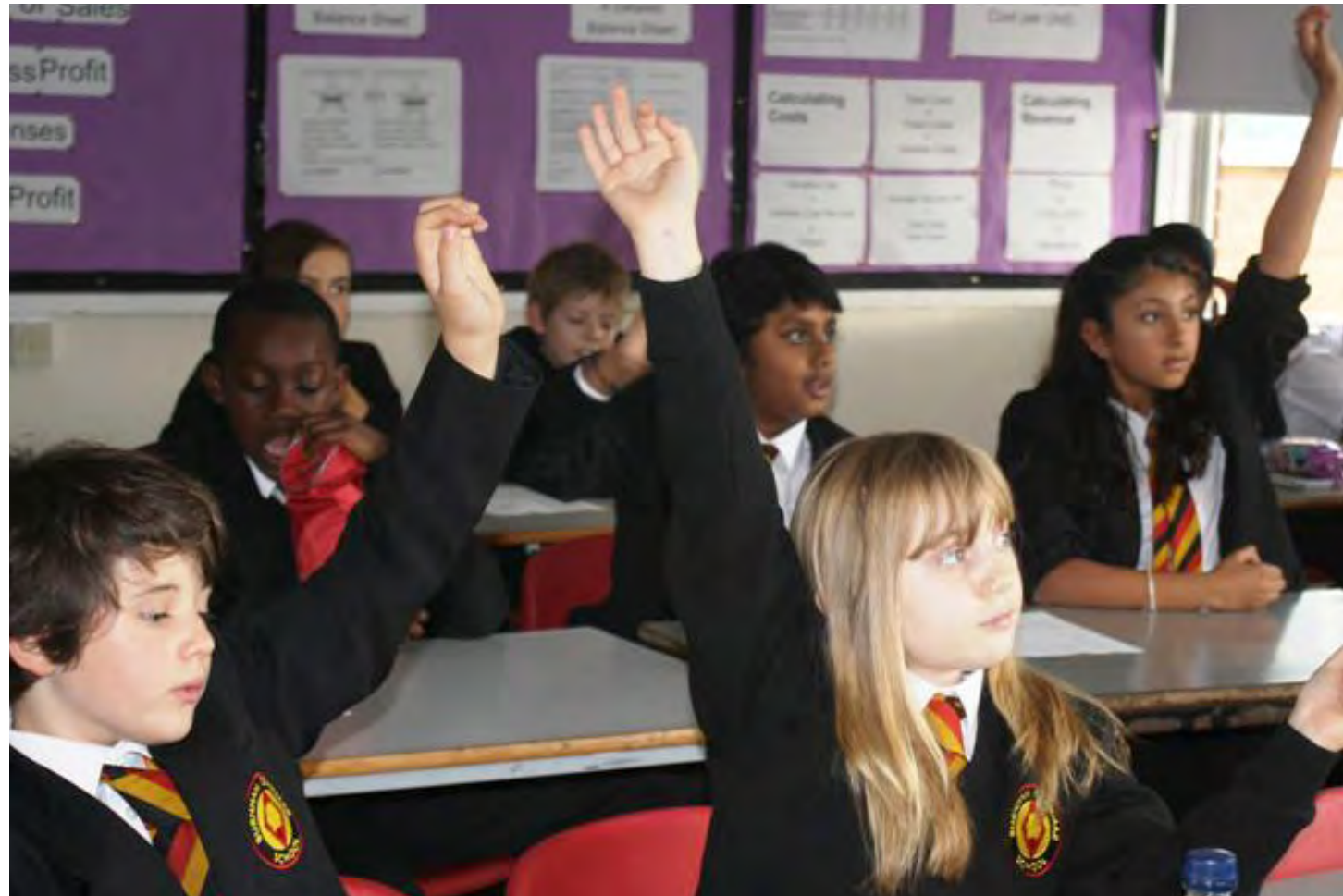
Participation in lessons

Project days also develop the organisational and interpersonal skills that are not tested in exams, but are vital for future success when working in and leading teams.